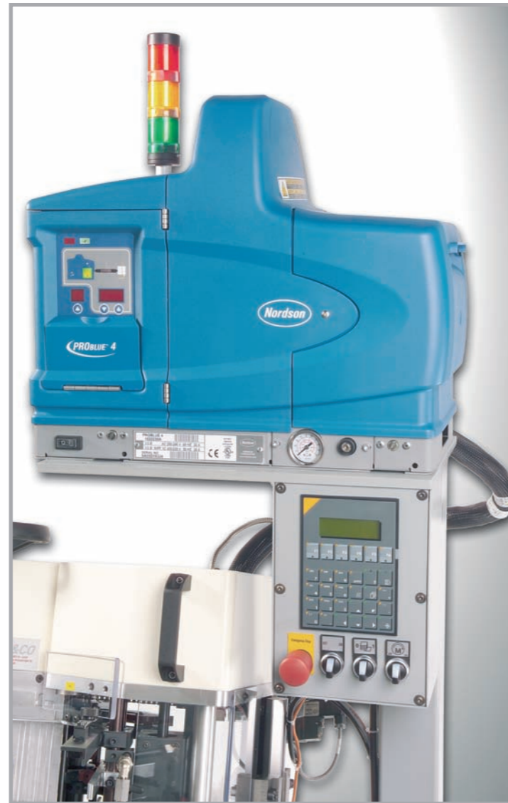
Hot glue device and dialogue control

A great variety of formats and insert styles can be processed using the Clever&Co. card gluer. The inserts that are to be glued can be placed on the complete area of the fixing side. An adjustable counter pressure plate with a pressure roller enables positioning of the glue line even underneath the transport chain of the saddle stitcher. Exchangeable segments allow small inserts to be stuck on directly in front of the pusher fingers of the saddle chain.